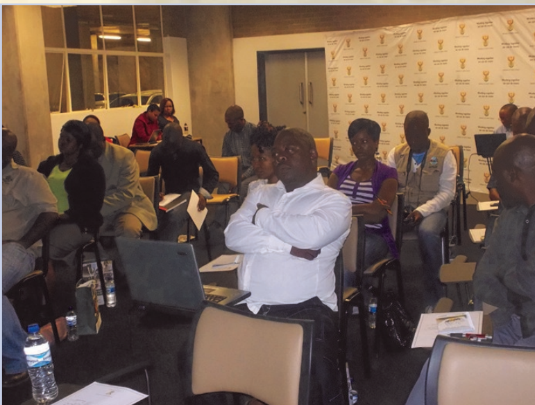
Members of the local media and communicators at the dialogue

Some of the recommendations from this dialogue were that hubs at the district levels be established, a continuous support (non-financial) and funding of the local media. Meanwhile calls were made for support to local media to be sustained and more training to be prioritised for political principals and communicators to utilise community media effectively.