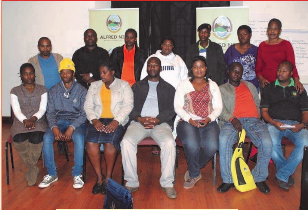
District Youth Council New Leadership

A lfred Nzo District Municipality as part of celebrating youth month held a District Youth Summit, where youth councils from all local municipalities converged to discuss youth development agenda and also to elect district youth council.