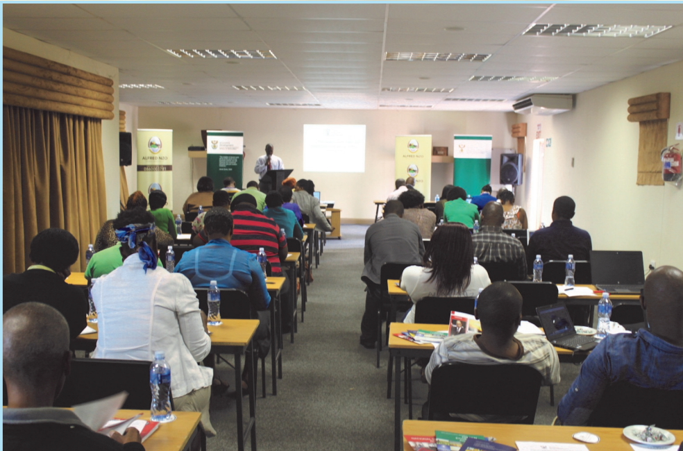
Stakeholders during workshop on New Economic Growth recently held.

In an effort to ignite local economic development, the Alfred Nzo District Municipality in partnership with the Department of Local Economic Development and Environmental Affairs and the Department of Trade and Industry organised a two days' workshop aimed at developing strategies to improve economic development inline with the National Growth Path.