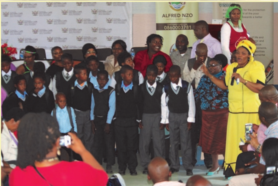
Learners from Mpendla J.S.S. and Dabula J.S.S., Mayor of Umzimvubu, M.E.C. Of Social Development and Special Programmes as well as councillors, and officials.