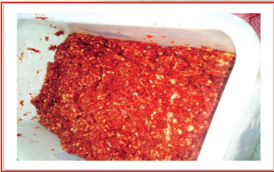
PROCESSED MINCE MEAT IN LOCAL BUTCHERY

A lfred Nzo District Municipality, Municipal Health Service (MHS), Environmental Health Practitioners (EHP's) in all local municipalities have embarked on an awareness campaigns to educate communities about meat safety targeting meat consumers to address the meat scandal that has dominated headlines in recent months. In the recent findings meat products have been found contaminated with mixed products like horse, meat, donkey and pork. Municipal Health Services in Alfred Nzo will continue inspecting butcheries and supermarkets that process meat and sell meat to consumers.