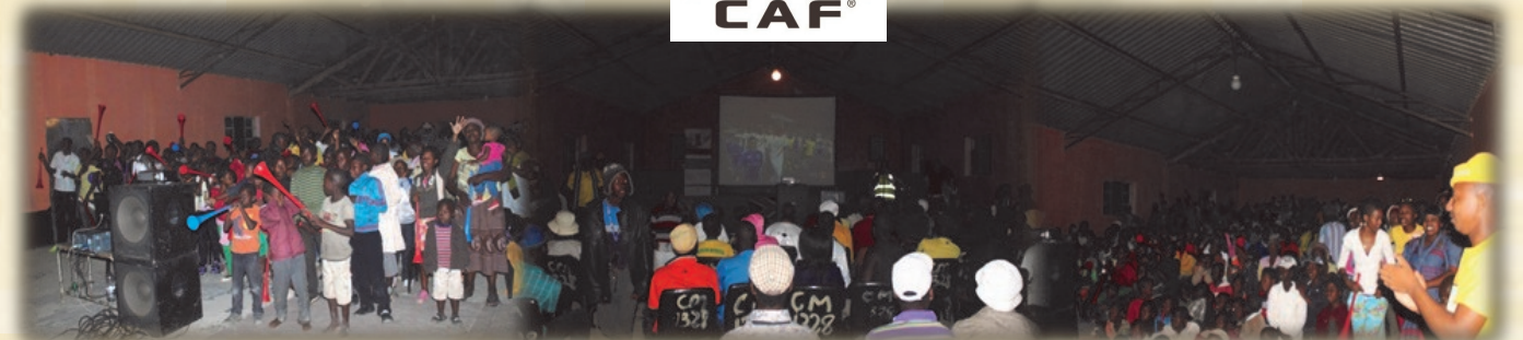
ABOVE: Community of Colana village in Mount Frere came in numbers to view the match between Bafana and Mali in a big screen held at Colana Mission.