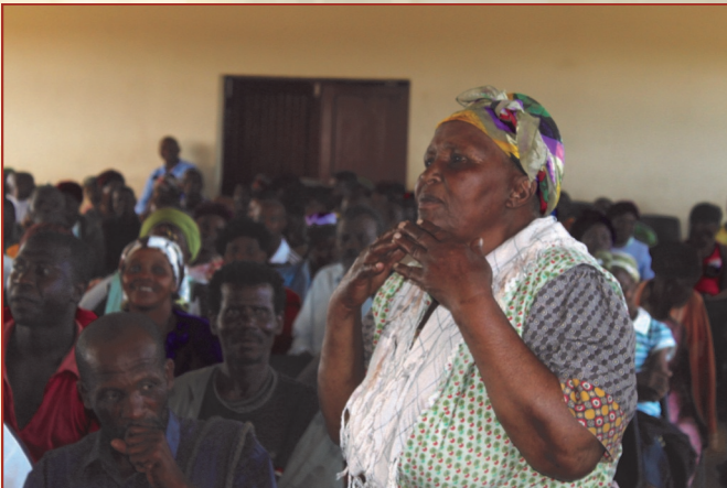
A community member at Mthukukazi village in Ntabankulu raising questions during community engagement held J.J.J. Ntlabathi Community Hall.