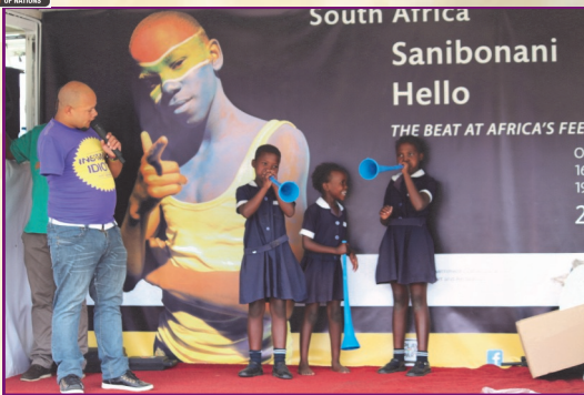
ABOVE: AFCON Truck Entertaining Communities

The Africa Cup of Nations (AFCON) triggered memories of the 2010 FIFA World Cup as the nation was gripped with excitement towards the second hosting of the prestigious continental show piece. The campaign to mobilise South Africans to rally behind the national team, Bafana Bafana and to support the African tournament, roadshows were conducted throughout the country. AFCON mobilising truck reached the length and breadth of the country and the people of district joined in the excitement, they had high hopes for the national team, that