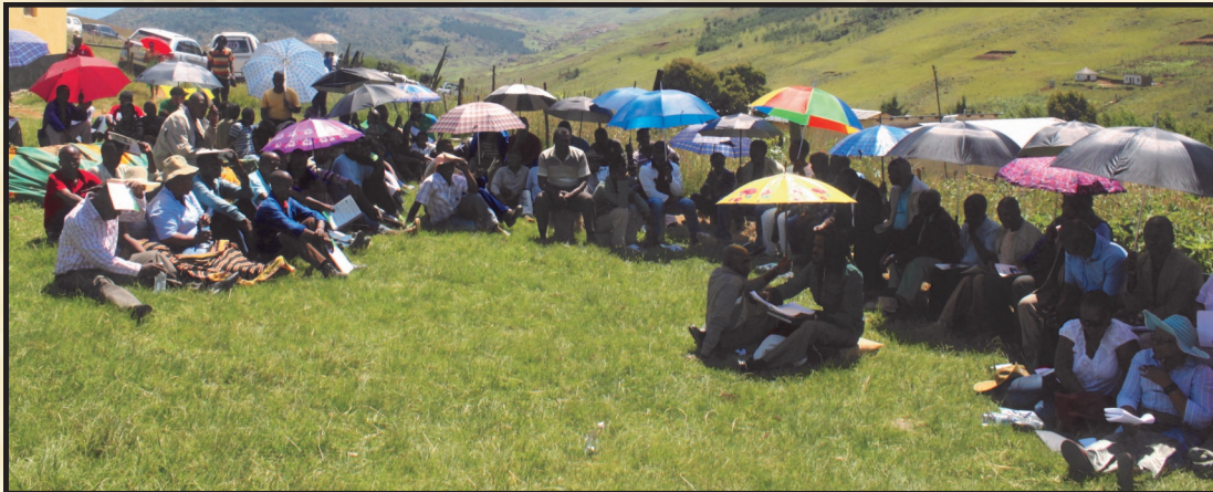
Community of Ward 4 during community engagement session at Sigidini village in Mount Ayliff.

The engagement provided an opportunity for communities to interact directly with government.