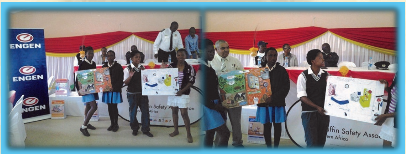
Learners from Cedarville Primary and Sive Special School showcasing their winning safety charts

C edarville is one of the areas that uses paraffin and the paraffin campaign was conducted to educate communities about safety measures. The campaign targeted Kennersly Primary, Cedarville Primary and Sive Special School. The awareness exposed communities on hazards associated with using paraffin and safety measures to follow when using paraffin appliances. Some of the lessons provided to communities include lessons like: when using paraffin stove keep your windows open so that fresh air can enter your room or house.