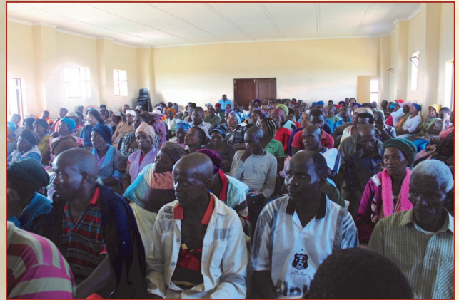
Community members at Mthukukazi village in Ntabankulu Local Municipality during community engagement.