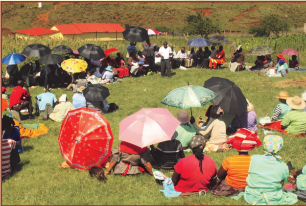
Community members at Sigidini Village ward 04 Mount Ayliff in Umzimvubu Local Municipality during a community engagement.