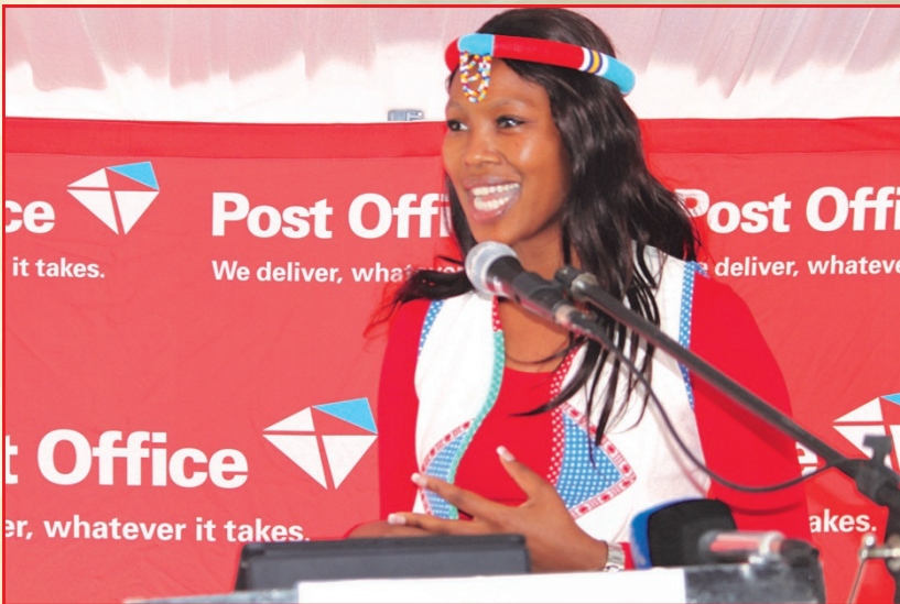
ABOVE: Deputy Minister of Communication delivering her speech

The post office was built after communities made a request to SAPOS due to long distance that they were travelling to receive or post letters, deposit cash and buy airtime to nearby towns. During the construction of the post office, ten (10) community members got employed and currently four people are in the process of getting permanent jobs to run the post office.