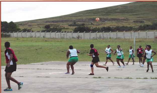
Girls in action during wellness day in Mount Ayliff stadium.