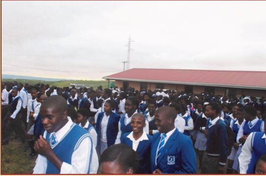
Mpondombini Senior Secondary School Acknowledged: Page 5