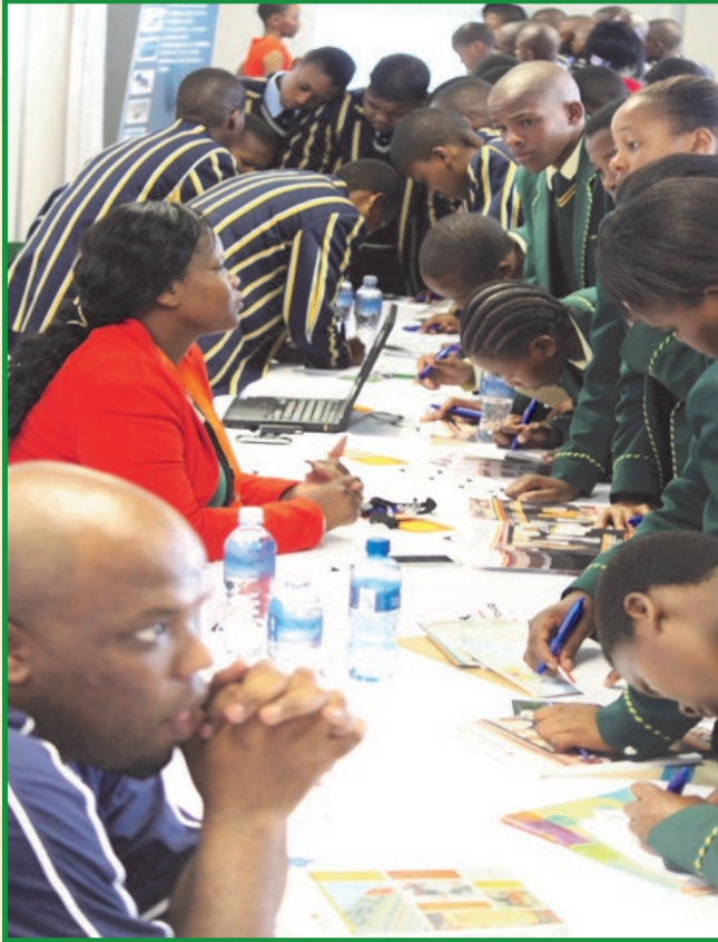
ABOVE : SEDA staff assisting learners with information on stalls during SEDA Fair in Mount Ayliff.

S mall Enterprise Development Agency (SEDA) in partnership with the Eastern Cape Development Co-operation (ECDC), Productivity SA, National Empowerment Fund (NEF), Department of Trade and Industry (DTI), NAFCO, MINITEK, ECITI, NYDA and SARS, Small Enterprise Financial Agency (SEFA) and local municipalities of this district recently conducted an Entrepreneurship Fair in Mount Ayliff.