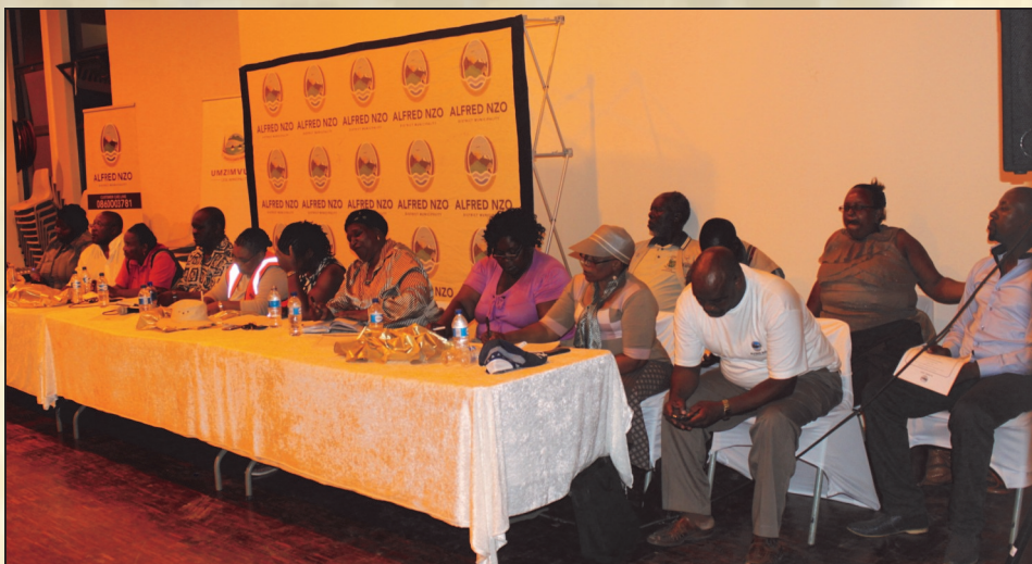
Alfred Nzo District Municipality Councillor and Umzimvubu Local Municipality listening attentively to communities during stakeholders engagement session that was held in Umzimvubu Local Municipality in Mount Frere during the Outreach.