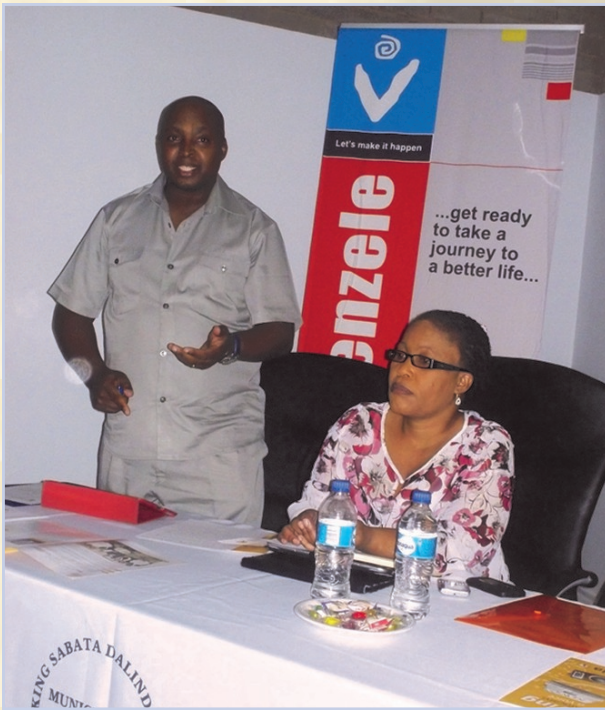
The CEO of MDDA (standing) and Executive Mayor of KSD (seated) responding to questions by the local media and communicators during the dialogue.

The local media from Alfred Nzo, OR Tambo and Joe Gqabi met in Mthatha in the first of its kind Vukuzenzele community media breakfast dialogue that was organised by Government Communication and Information System (GCIS). This media dialogue was one of the post State of the Nation Address (SoNA) communication activities, where in stakeholders are engaged about SoNA.