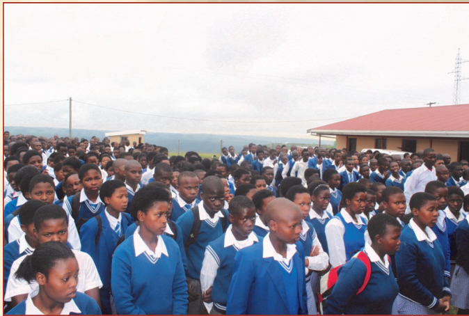
Mpondombini S.S.S. Learners Listening During The Visit.

As part of the district wide outreach the leadership of the municipalities also engaged with ratepayers in Mbizana, to understand challenges in relation to services that are provided to this area. Ratepayers raised critical issues that needs to be addressed by government in the town of Mbizana, like upgrading of access roads, address water cuts that are a daily occurrence in the town and also called in government to close potholes that are all over the main and access roads in the area. They further called upon government to build a bypass in the town of Mbizana to address traffic congestion.