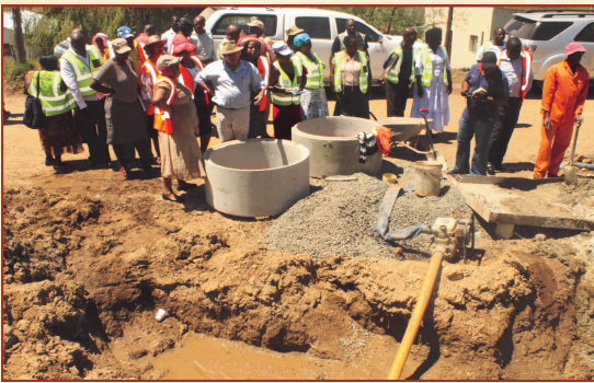
Service Delivery Sites Visited: Page 7