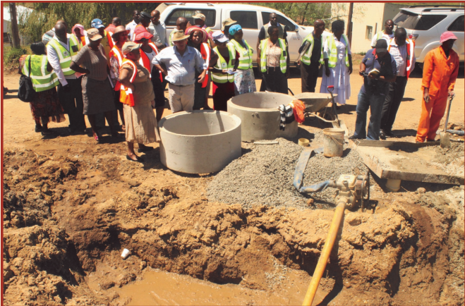
Councillors checking progress on sanitation project in the town of Ntabankulu during community outreach