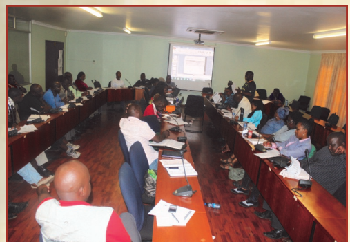
Government to Government Engagement session in Mbizana Local Municipality

The Mbizana outreach was closed off with government to government engagement session where political leadership convened all organs of the state in the district to table the findings of the outreach and develop an action plan to address issues raised during the outreach.