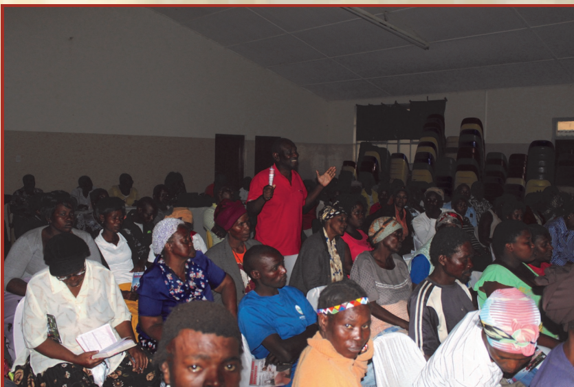
Community of Ntabankulu Local Municipality raising questions during stakeholders engagement in the town hall.

High rate of crime, was identified as one of the big challenges, moreover that the area is dark at night as there are no lights and Community recommended the installation of high masts. Teenage pregnancy and HIV and AIDS was prevalent among issues raised in most households.