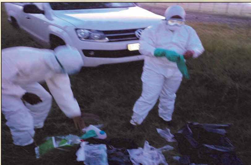
Exhumation in progress, funeral parlour personnel wearing disposable protective clothing under the supervision of ANDM Environmental Health Practitioners (MHS).

M unicipal Health Services in Alfred Nzo amongst its priorities is to manage, control & monitor exhumations and burials or disposals of human remains in a proper and dignified manner. Municipal Health Services unit is currently conducting awareness in different areas across the district to educate communities about processes that need to be followed when conducting exhumations of body remains.