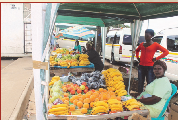
Hawkers at Mbizana Taxi Rank posing for a camera.