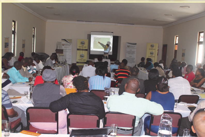
ABOVE: Representative from South African Weather Services (SAWS) doing presentation during the Disaster Management Workshop.

The purpose of the workshop was to develop strategies to avert disaster phenomenon's within the district and also develop guidelines on disaster risk management, conduct advocacy and public awareness campaigns. The guidelines that needs to be developed are to be aligned to United Nations principles and other intercontinental strategies which are aimed at developing uniform approaches to disaster management.