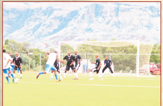
Soccer team in action during wellness day