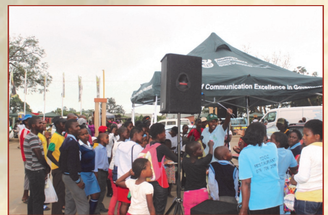
Communicators conducting pre - State of the Nation Address ( SoNA) rank activation held in Mbizana Taxi Rank .