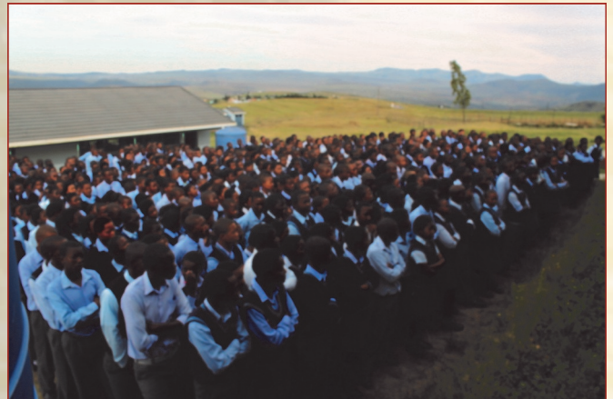
Zwelakhe S.S.S. Learners Listening Attentively To Councillors During Visit As Part Of Back To School Campaign.