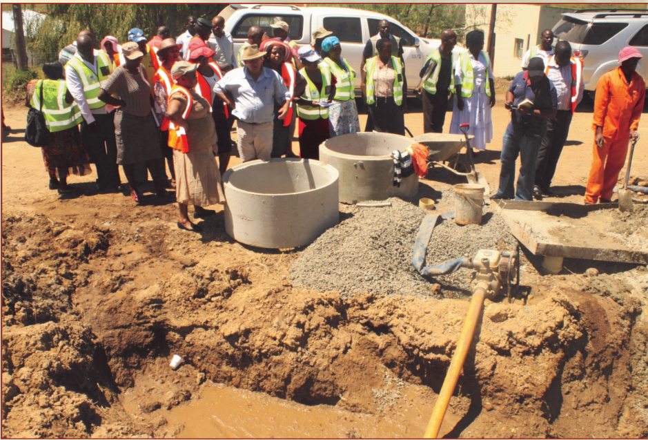
Councillors and officials checking the progress on sanitation project that is currently under way in the town of Ntabankulu.

water flowing from the yards and water also flowing from the sport field. The door to door campaign at 471 was conducted by Councillors accompanied by government officials. Critical issues were raised by communities such as electricity, shortage of taps, sanitation facilities that are far from where they stay.