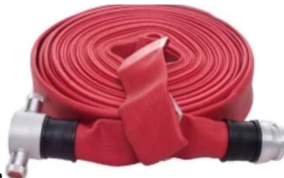
65 mm Double Jacket Firefighting Hose