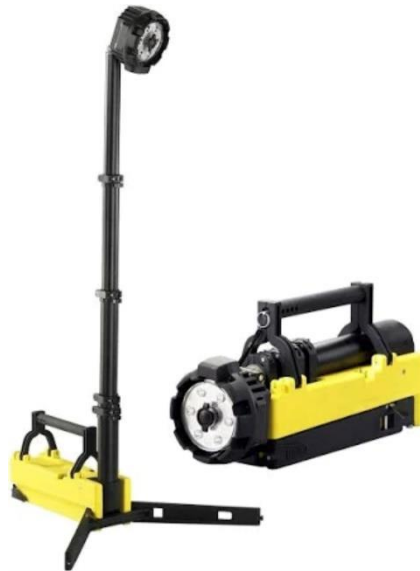
Battery Operated LED Rechargeable Scene Light