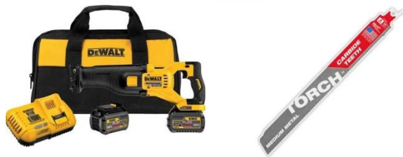
Heavy-Duty Battery-Operated Reciprocating Saw