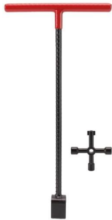
Standpipe key & bar