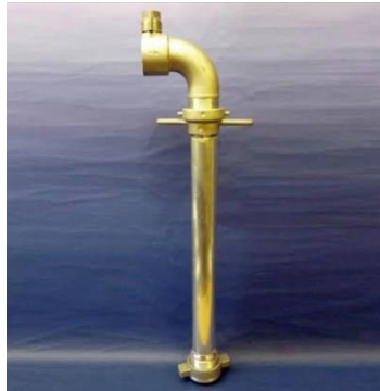
Firefighting Hydrant Standpipes