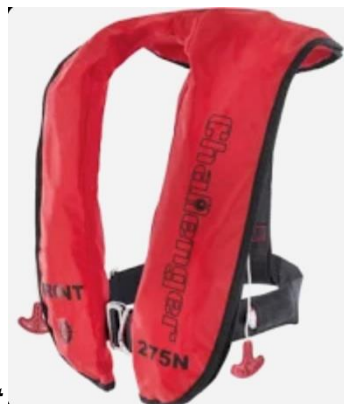
Life Saving Jacket