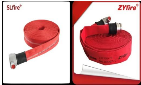
28 mm Double Jacket Firefighting Hose